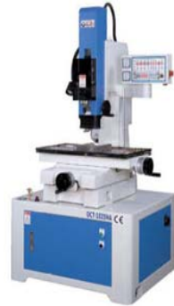
Anotronic-Ocean EDM Drilling Machines Manual, ZNC, CNC