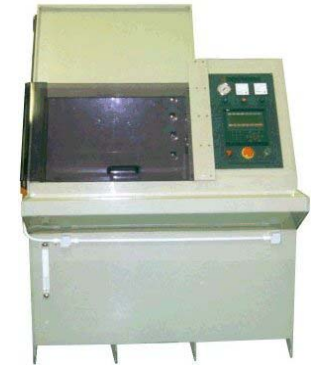
Anotronic Electrochemical Deburring Machines (ECD)