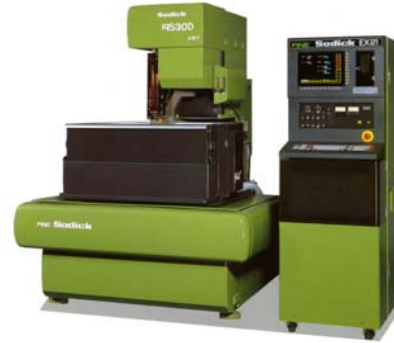
CNC Wire EDM Sub-Contract On The Latest Technology Machines