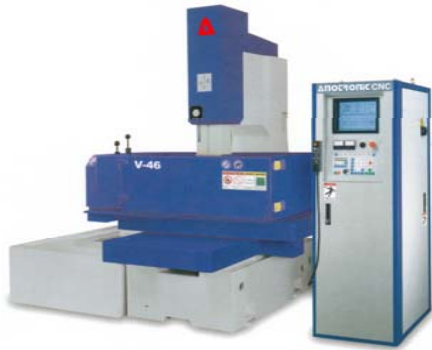
Anotronic-Maximart EDMs ZNC, PNC, CNC