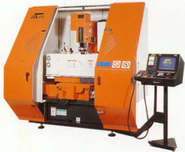
Anotronic-SKM EDMs Manual, NC, CNC