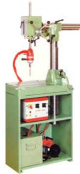
Anotronic-Eromobil Tap and Drill Disintegrators