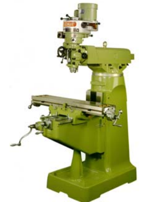
Anotronic-Maximart Turret Milling Machines