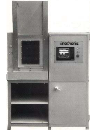
Anotronic Electrochemical Diesinking Machines (ECM)