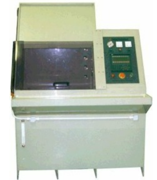
Anotronic Electrochemical Deburring Machines (ECD)