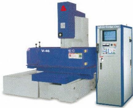
Anotronic-Maximart EDMs ZNC, PNC, CNC