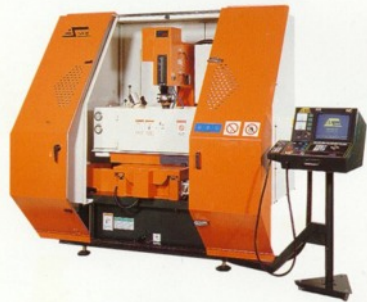
Anotronic-SKM EDMs Manual, NC, CNC