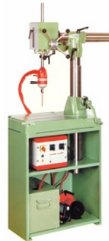
Anotronic-Eromobil Tap and Drill Disintegrators