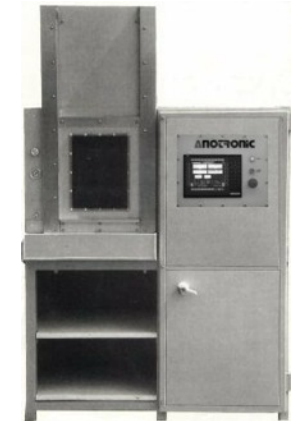
Anotronic Electrochemical Diesinking Machines (ECM)